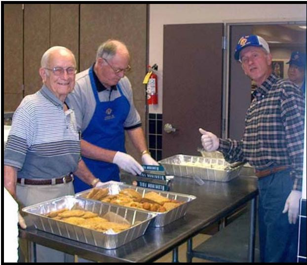
Knights of Columbus Council 786 members serve fish at their Annual Fish Fry to support Santa Maria.