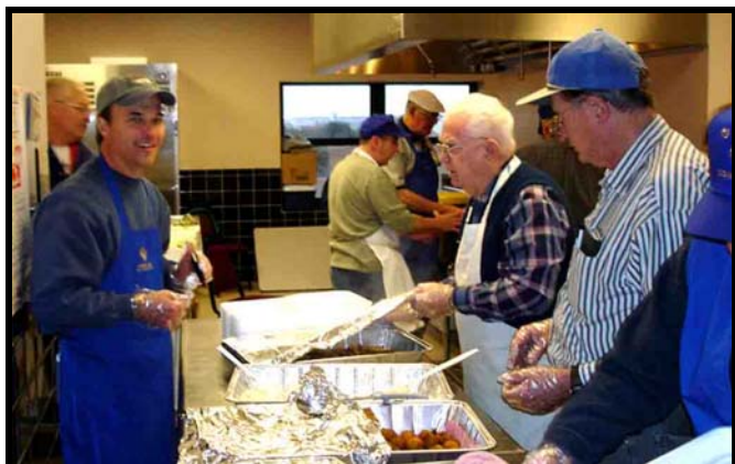
Knights of Columbus Council 786 members prepare plates for their Annual Fish Fry to support Santa Maria.